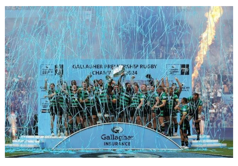
The Northampton Saints Premiership Champions 2023/2024

On a sporting front the town has a football, rugby and cricket team. The football team "The Cobblers" play at Sixfields Stadium in Division 1. The rugby team, Northampton Saints, play at Franklins Gardens in the Gallagher Premiership and won the title for the second time in 2024. The cricket team were promoted to Division 1 of the County Championship in 2019.