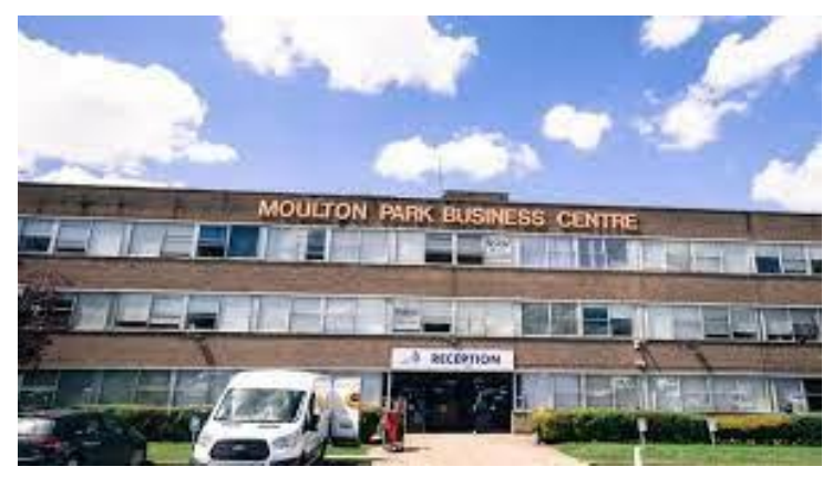
Moulton Park Business Centre - the course location

If you have any questions or require any further information about anything in this guide then please send an email to: training@sierra.uk