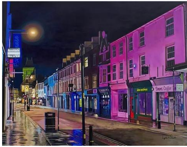
Francis Crick statue Abington St. and St Giles St in the town Centre