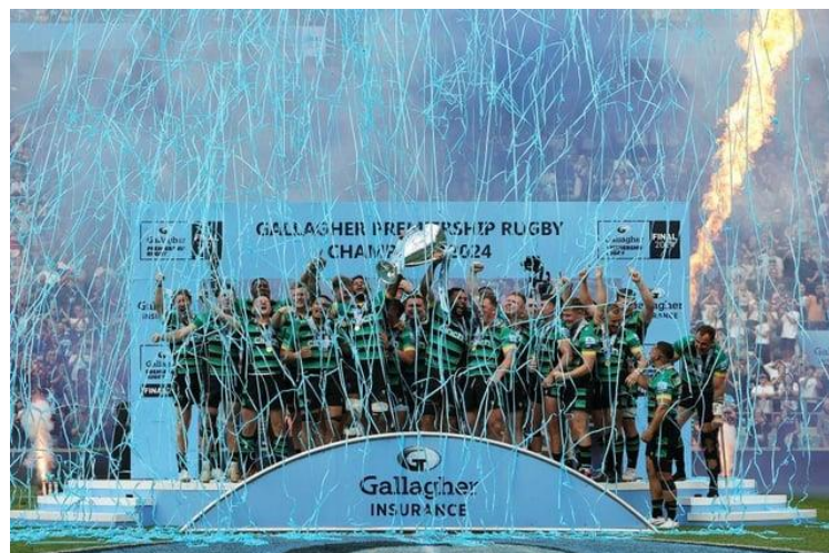
The Northampton Saints Premiership Champions 2023/2024

On a sporting front the town has a football, rugby and cricket team. The football team "The Cobblers" play at Sixfields Stadium in Division 1. The rugby team, Northampton Saints, play at Franklins Gardens in the Gallagher Premiership and won the title for the second time in 2024. The cricket team were promoted to Division 1 of the County Championship in 2019.