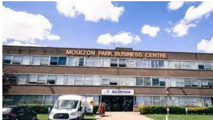
Moulton Park Business Centre – the course location

If you have any questions or require any further information about anything in this guide then please send an email to: training@sierra.uk